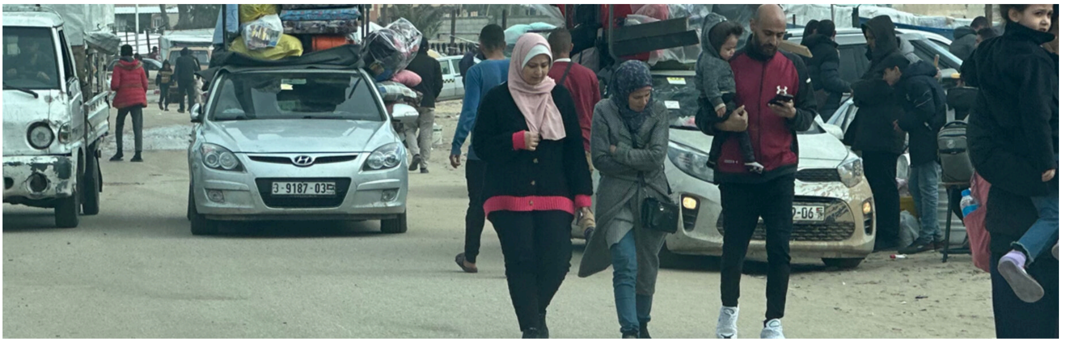
Displaced families heading south amid intensified hostilities in Khan Younis and following the expansion of Israeli evacuation orders to additional residential areas. Photo by OCHA/Olga Cherevko, 26 January 2024