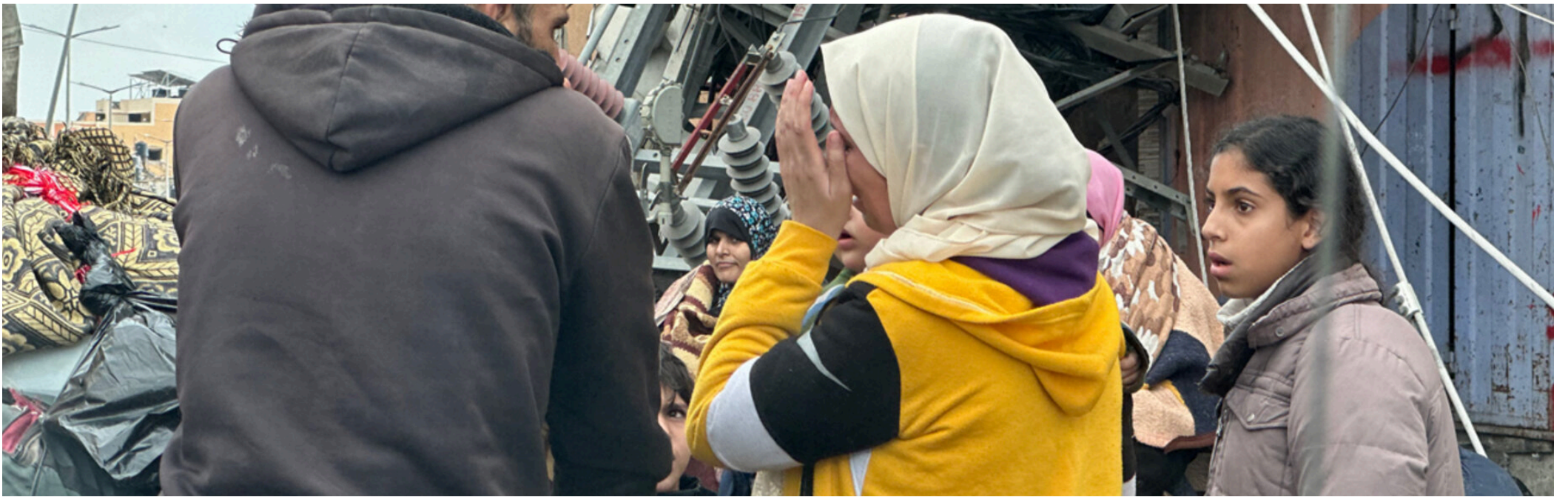
People standing in a destroyed urban area of Khan Younis during another wave of displacement toward Rafah as intense hostilities continue and following new evacuation orders for large residential areas. Photo by OCHA/Olga Cherevko, 29 January 2024