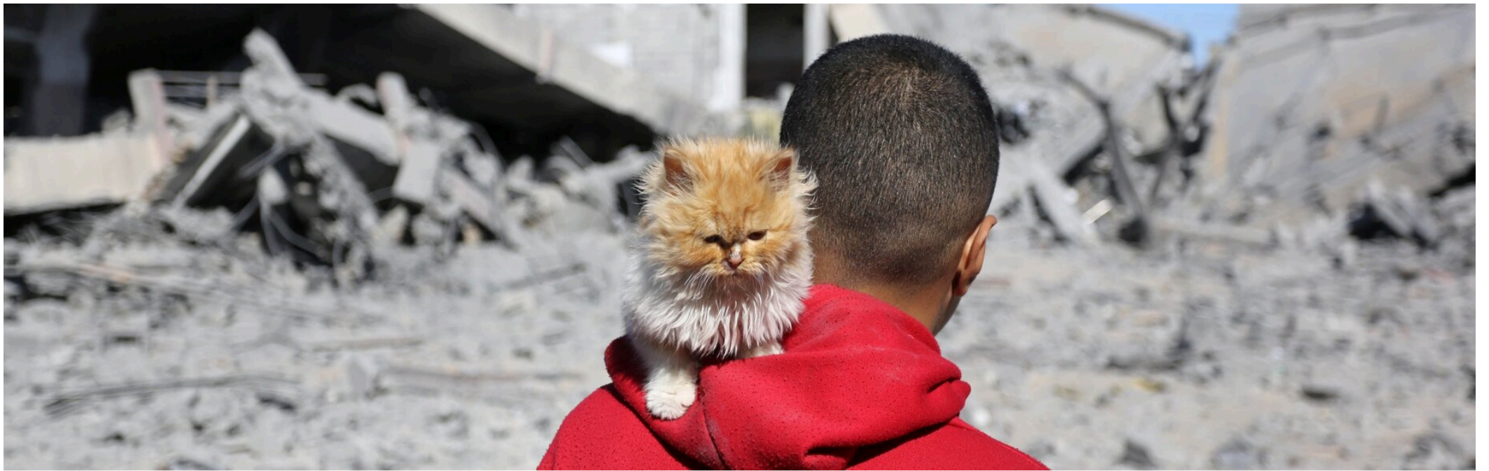
Intense hostilities continue in Gaza, resulting in casualties, displacement and devastation.