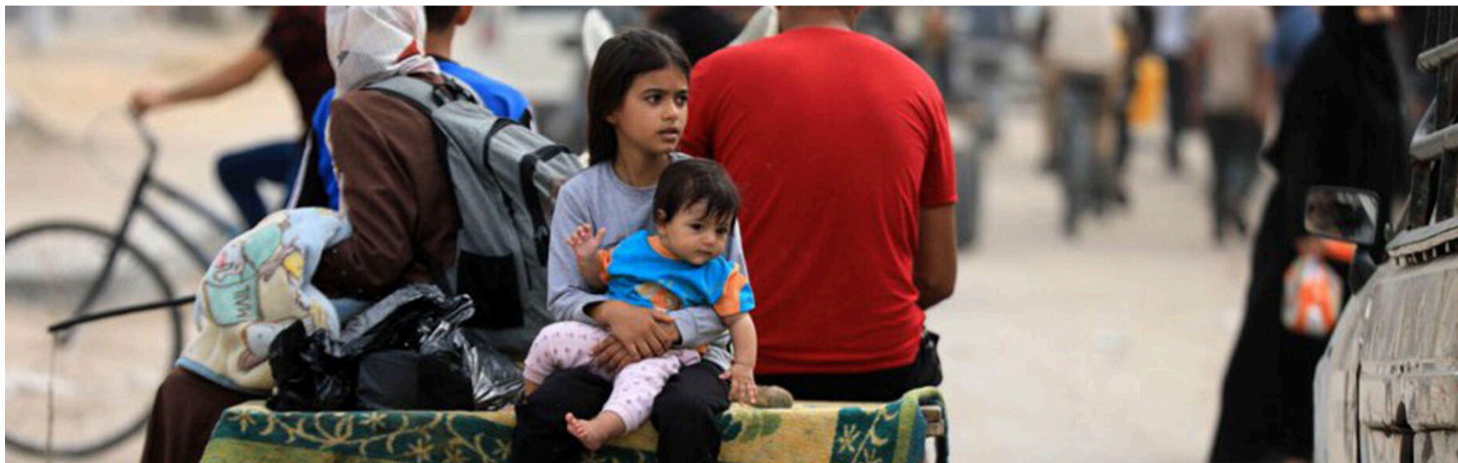
Palestinians fleeing Khan Younis on donkey carts in search of safety in the southern town of Rafah.