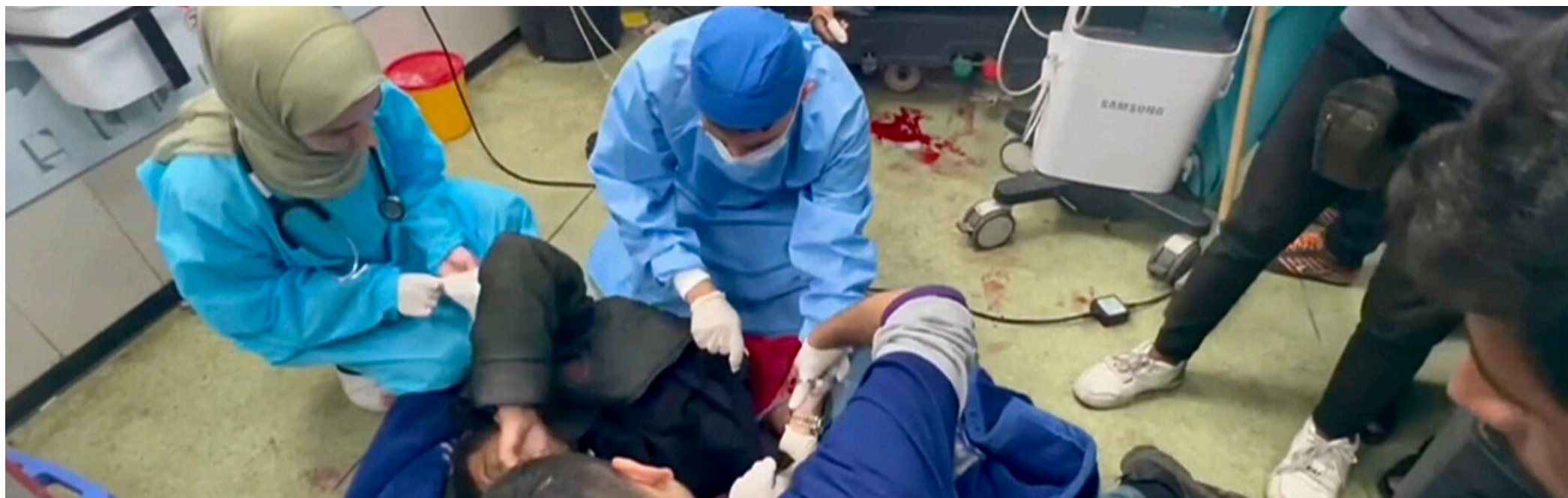
Medical team treating trauma injuries on the floor in Nasser hospital, Khan Younis.