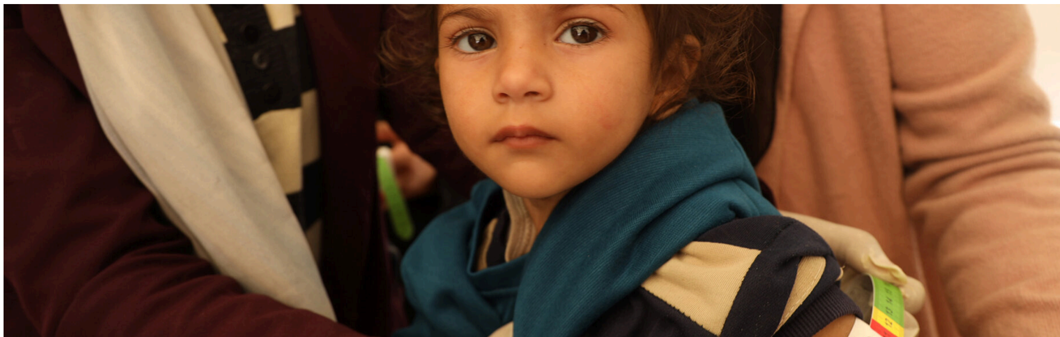
A two-year-old girl getting her middle-upper-arm-circumference (MUAC) measured. Her MUAC reads less than 10, indicating severe acute malnutrition, drastic weight loss, and muscle atrophy.