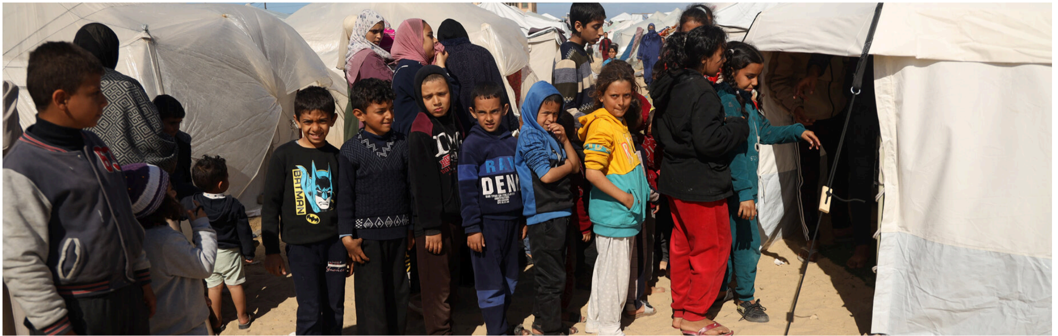
Children standing in line in front of a tent clinic in Rafah, to be screened for malnutrition and referred for treatment as necessary.