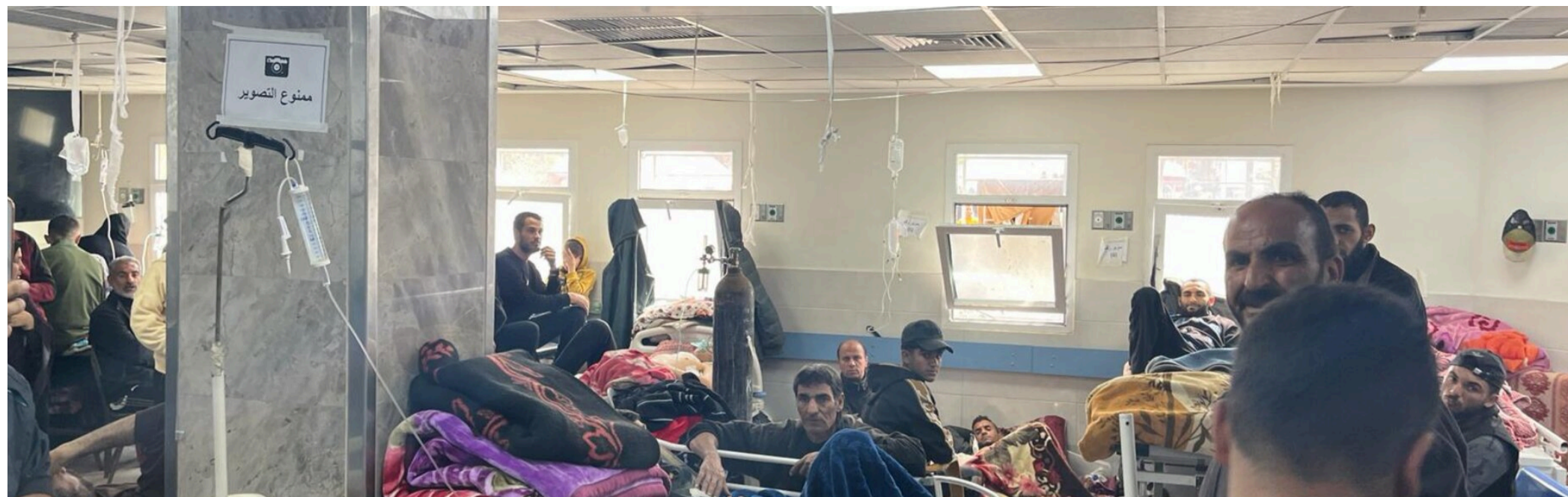
Some of the hundreds who were injured on 29 February on Rashid Road, in Gaza city, remain in critical condition, as the death toll has reportedly risen to 118. Shifa hospital, 1 March 2024.