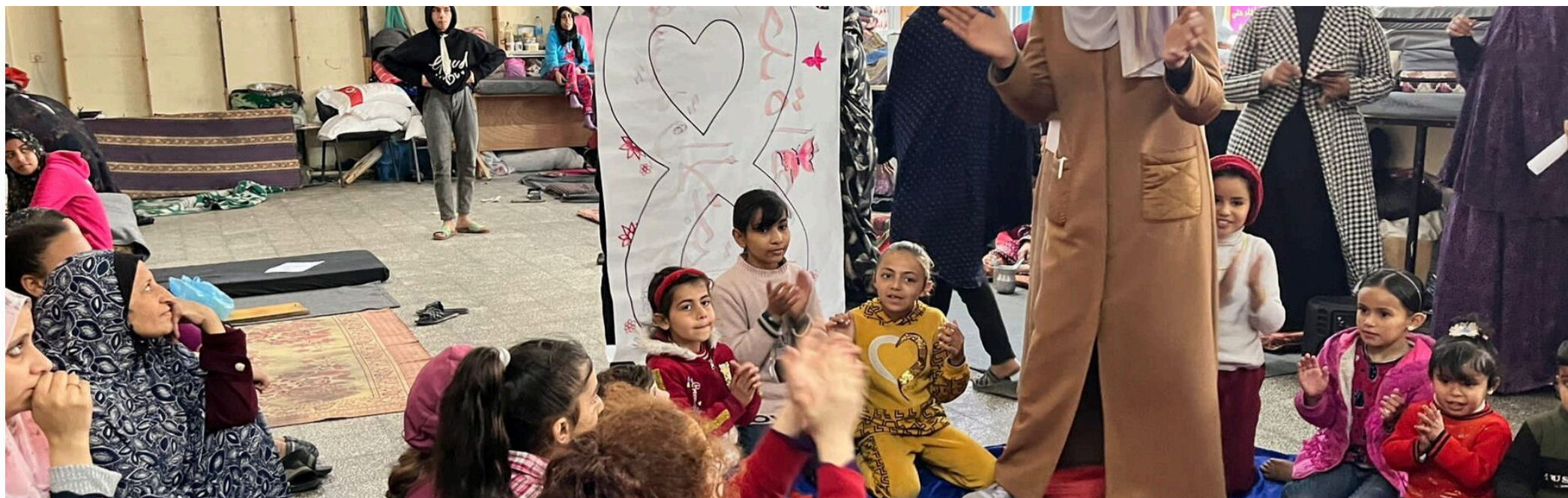
Psychosocial support teams help displaced families in Gaza through specialized activities.