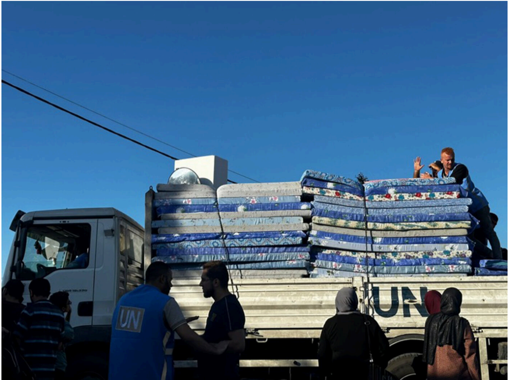
Mattresses distributed to internally displaced persons at a United Nations facility in Gaza.