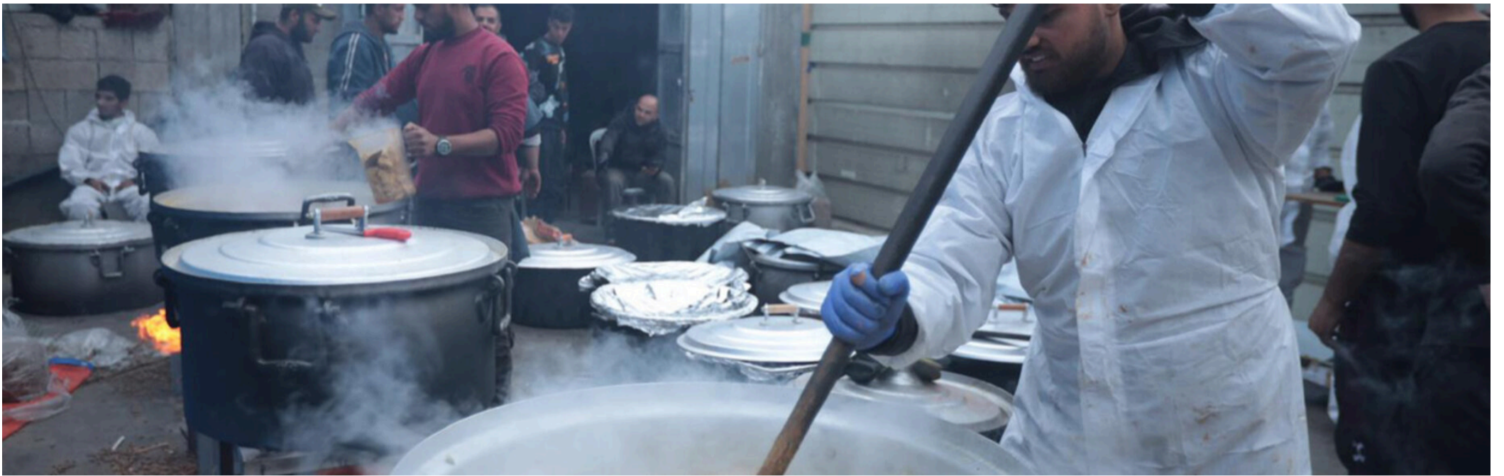
Humanitarian workers preparing hot Ramadan Iftar meals for displaced families in southern Gaza. Implemented by ANERA and World Central Kitchen, this is one of 122 relief projects currently supported by the occupied Palestinian territory Humanitarian Fund.