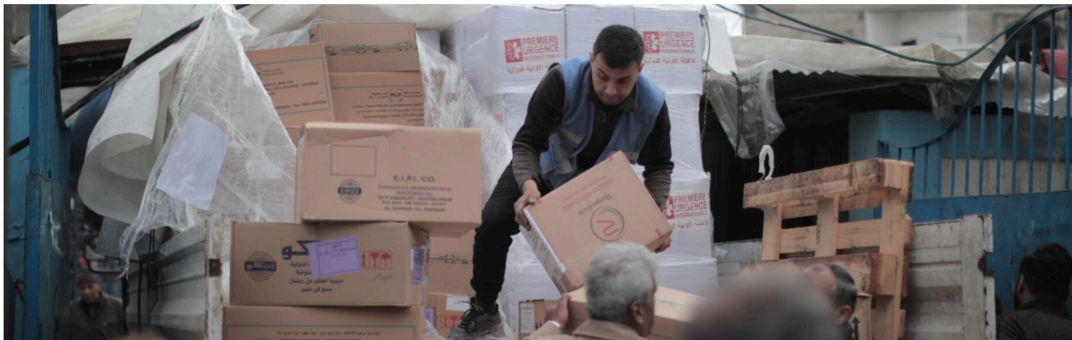
Offloading aid in Jabalya, northern Gaza. 19 March 2024