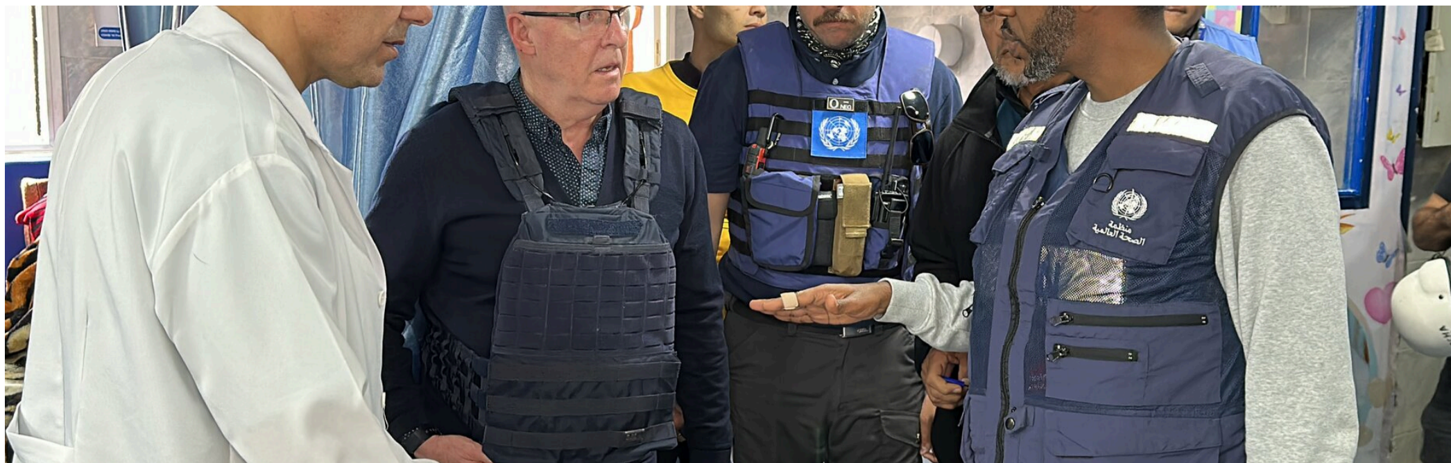
Kamal Adwan Hospital is the only hospital in northern Gaza providing treatment for malnourished children and one of four that remain partially functional in the area, March 2024.