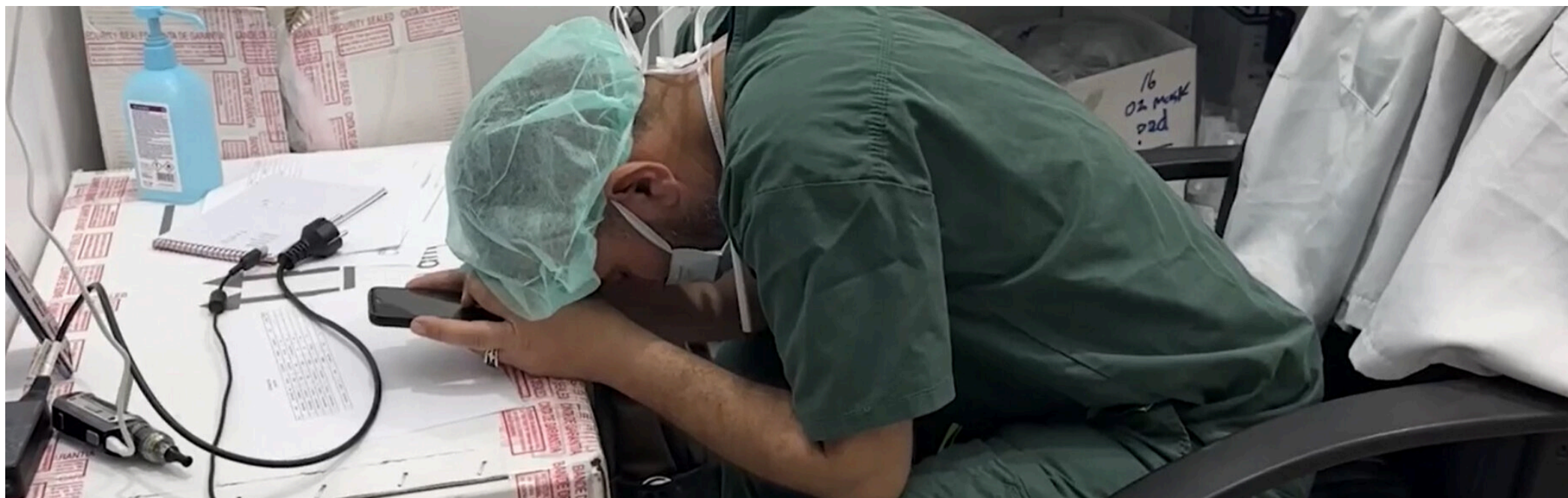
An overwhelmed medical worker in Gaza rests his head in his hands.