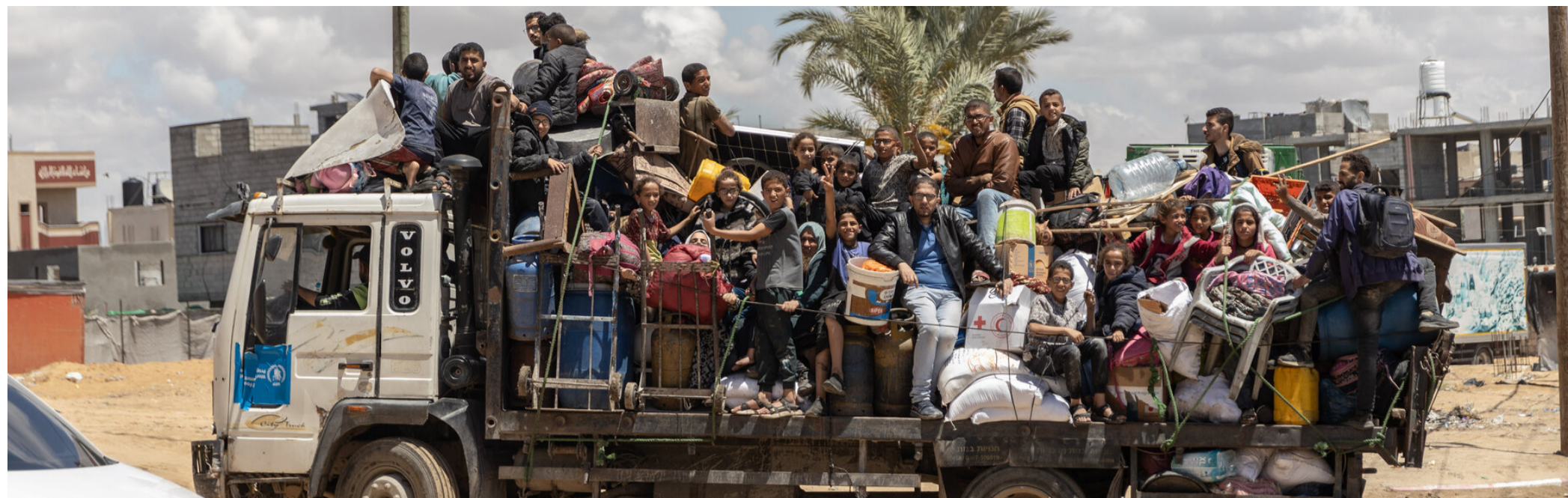
People leaving Rafah on 7 May 2024 following an evacuation order by the Israeli authorities.