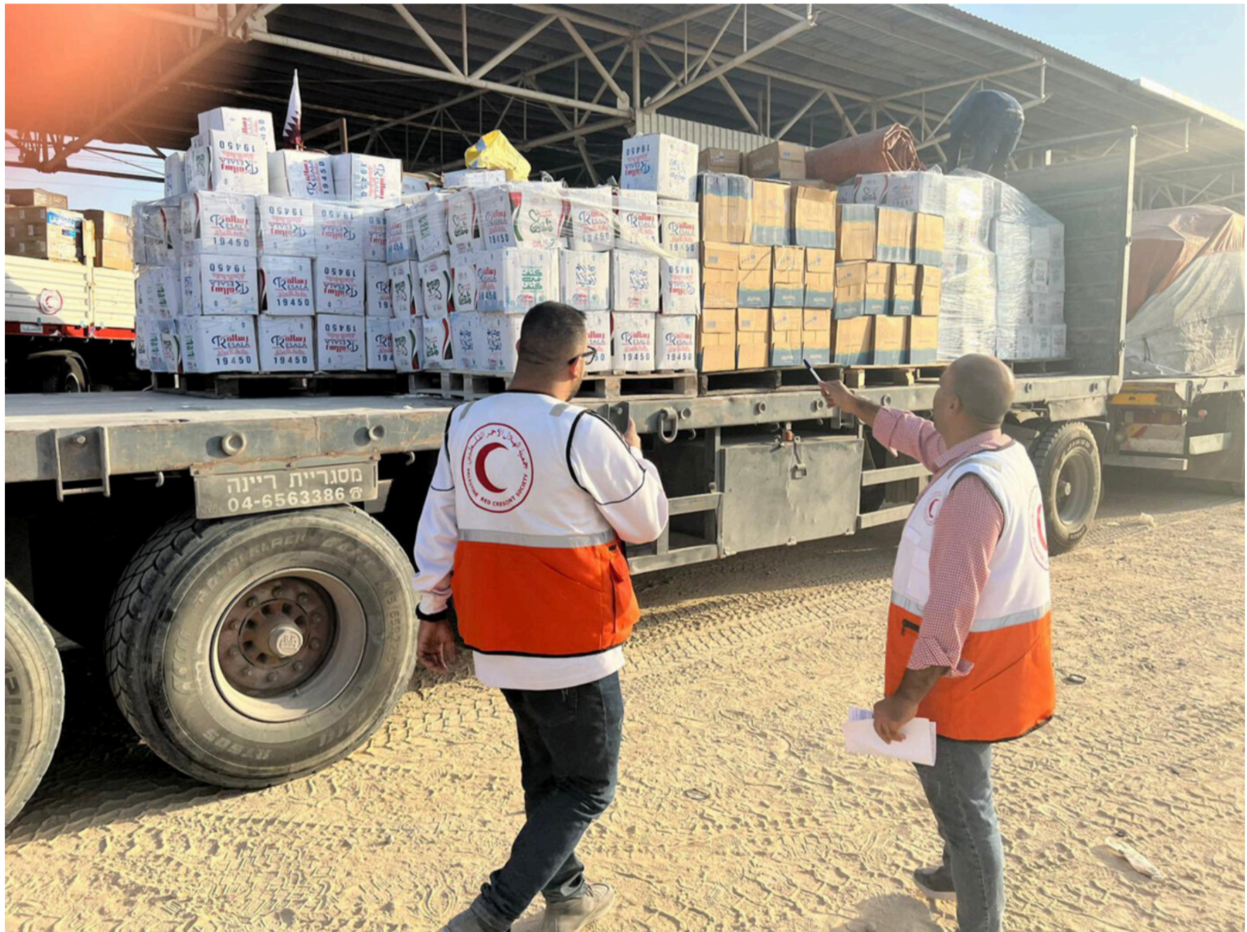
Humanitarian supplies received in southern Gaza, 23 October 2023.