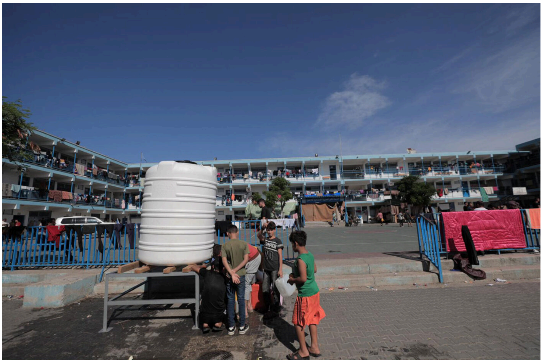
Displaced children queuing for water in a UN shelter in Gaza.