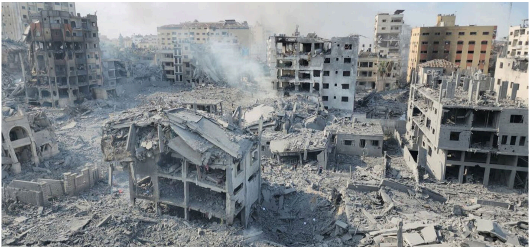
Devastation in Gaza.