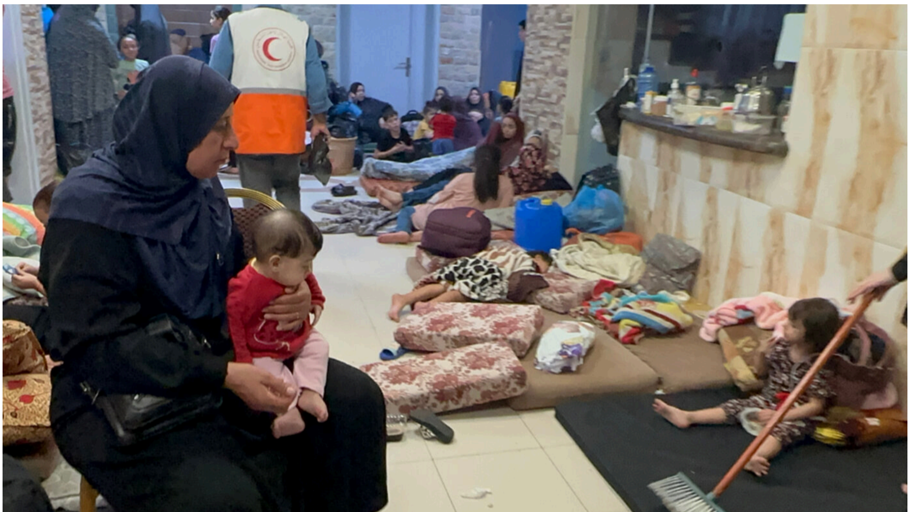
Displaced Palestinians staying at Al Quds hospital in Gaza, 29 October 2023.