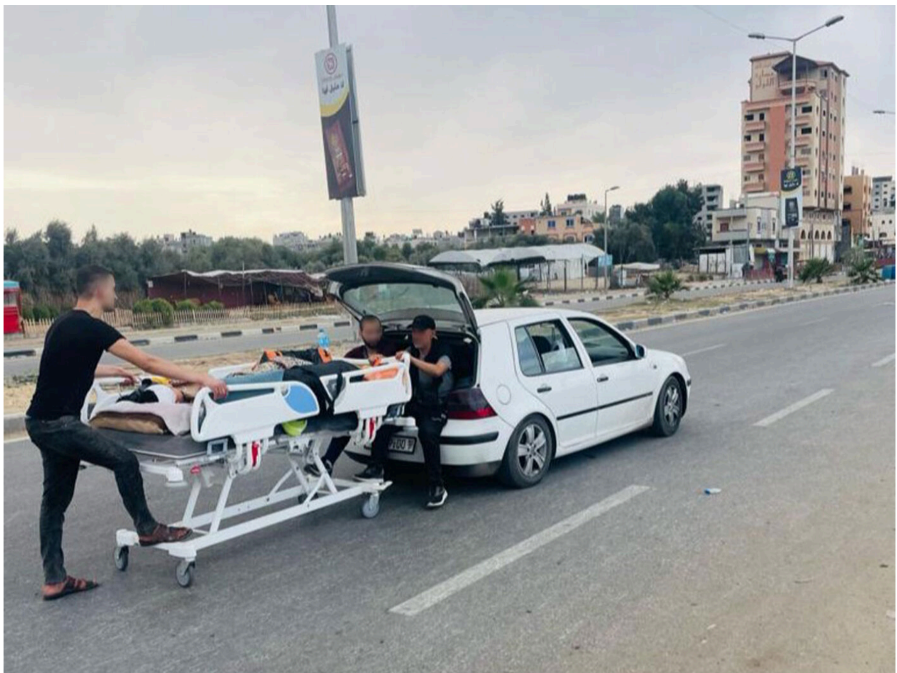
A hospital patient being transported southwards through a “corridor” opened by the Israeli military following its calls to evacuate northern Gaza. Photo by OCHA, 12 November 2023