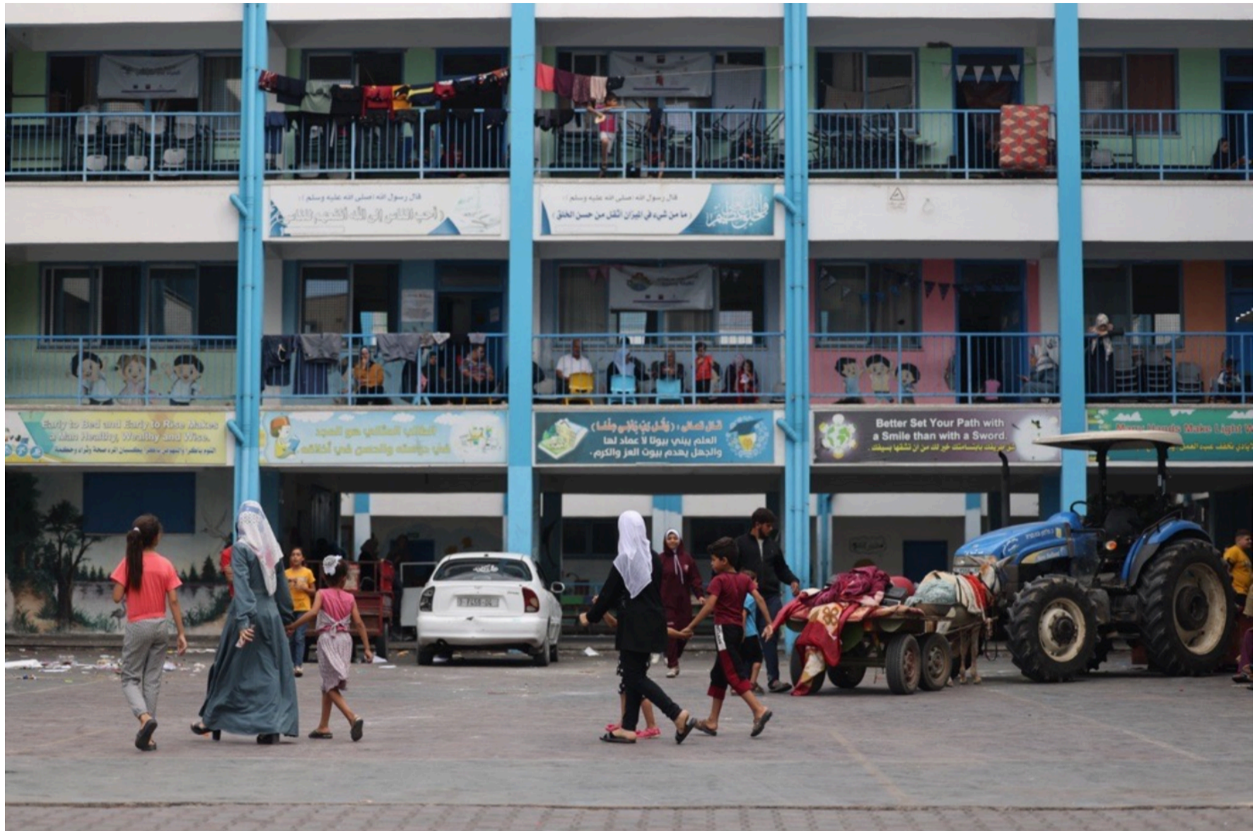
Internally displaced persons sheltering in an UNRWA school.