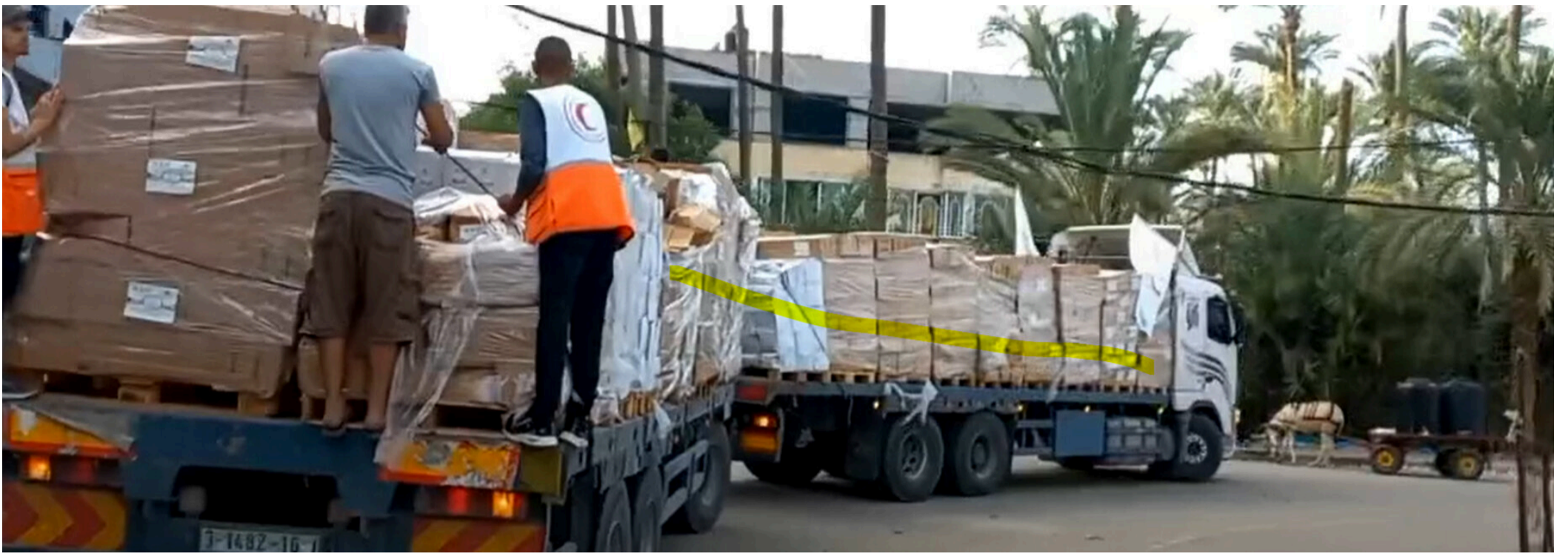
Aid distribution in the Gaza Strip. Screenshot from a video by PRCS