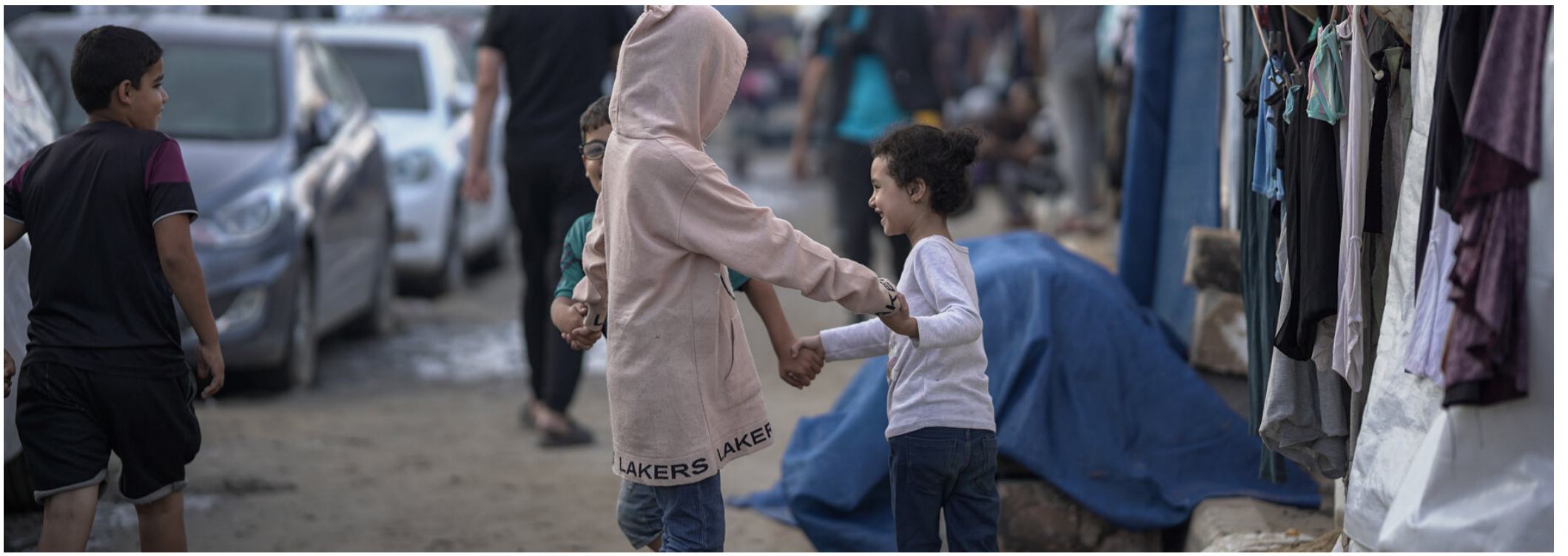
Displaced children in an UNRWA camp in southern Gaza. 14 November 2023