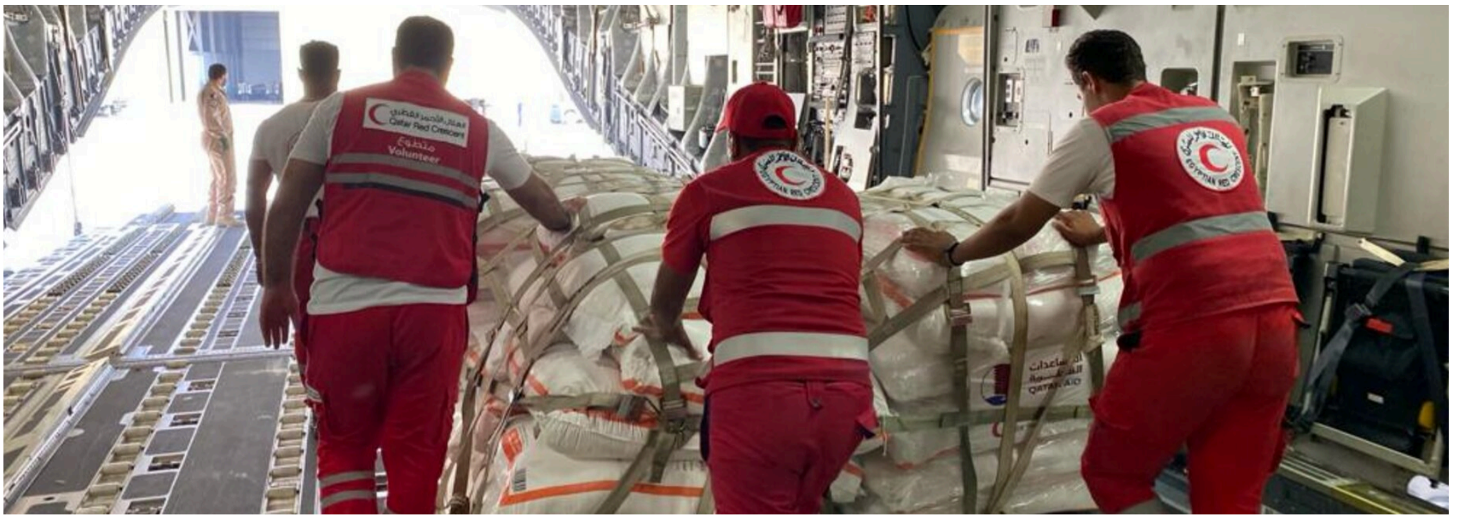
A logistics team from the Egyptian Red Crescent Society in Al Arish airport, Egypt, organizing and preparing humanitarian aid for transport into Gaza.