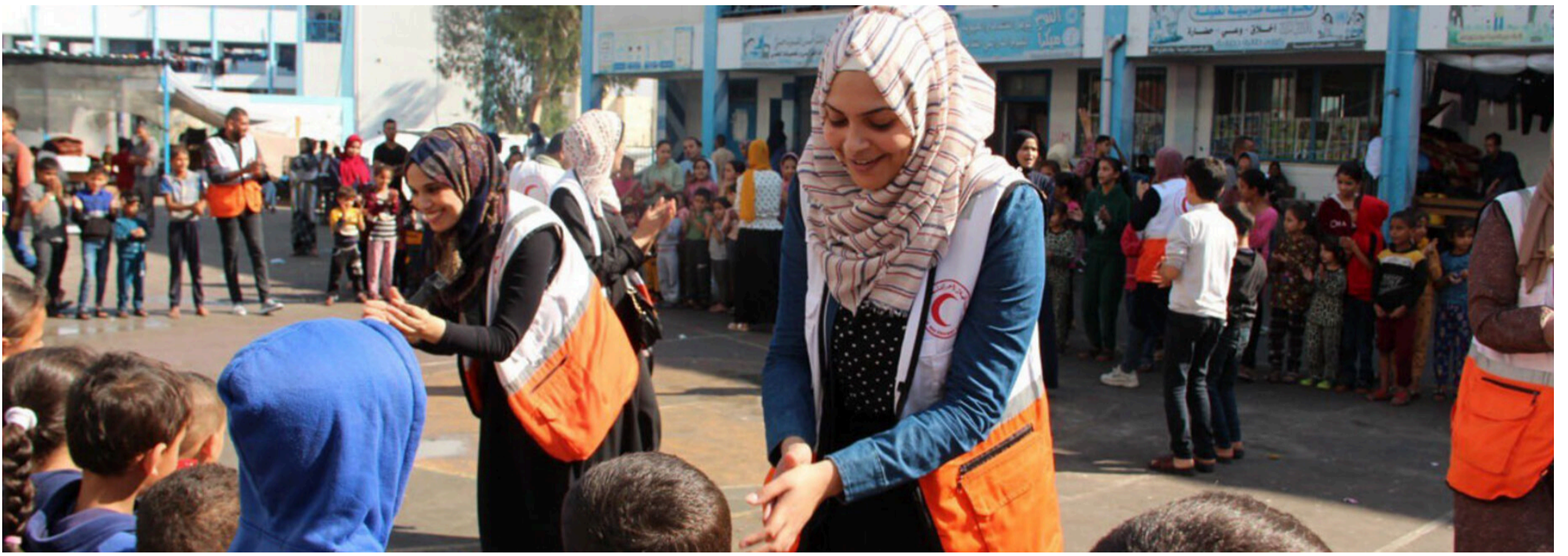
Volunteers providing psycho-social support to children in southern Gaza through recreational activities in a school being used as a shelter for displaced people.