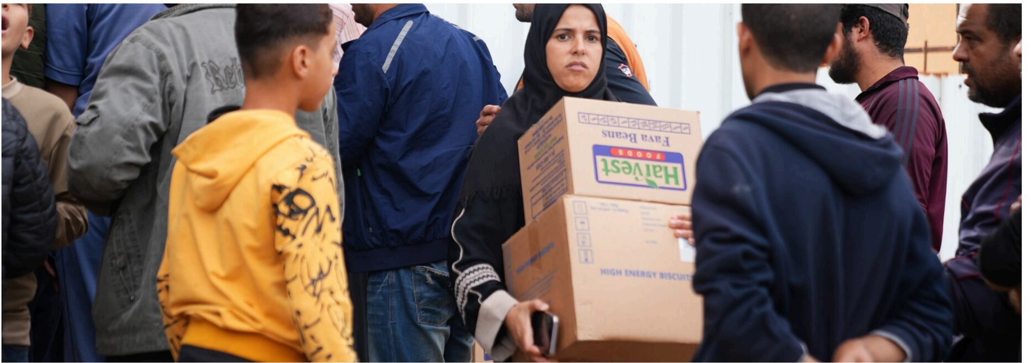
People queueing for food assistance. Across Gaza, most areas are off limits or unsafe for humanitarian organizations to reach and provide critical assistance. A recent survey has found that one in every three respondent families is experiencing severe hunger. 8 December 2023