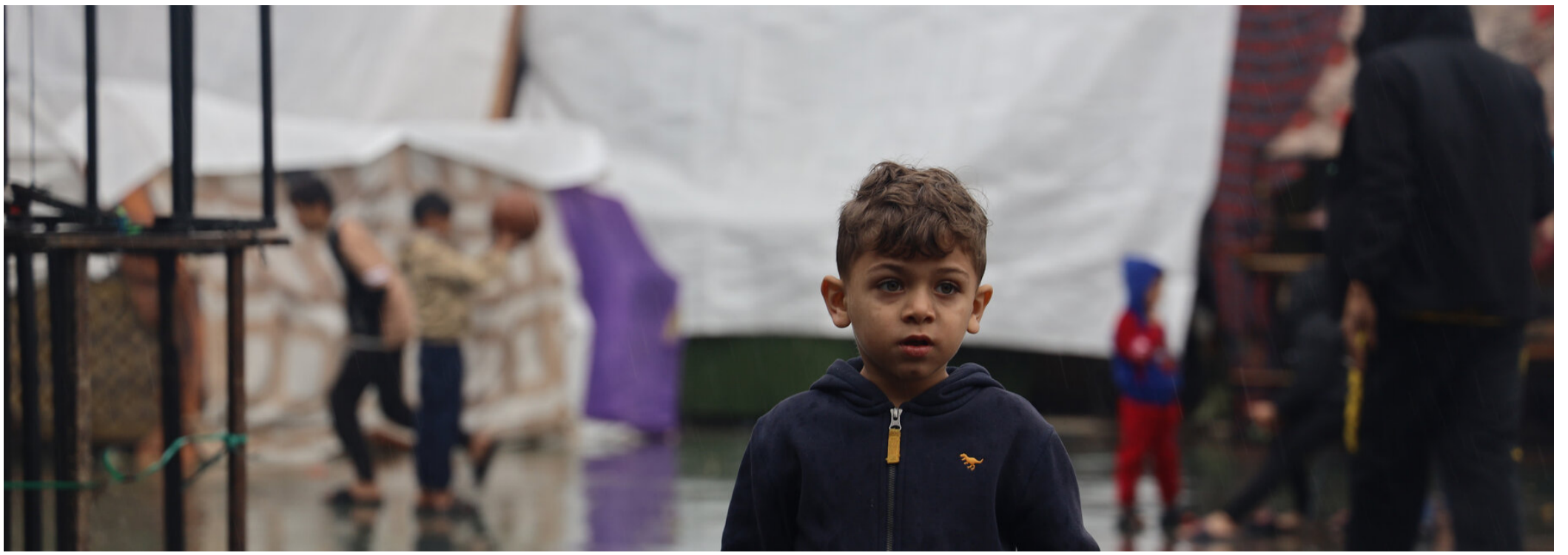
A 6-year-old displaced boy in southern Gaza, where heavy rains have worsened the already dreadful living conditions of people staying outdoors, adding to the risk of waterborne diseases. Photo by UNICEF/EI-Baba, 6 December 2023