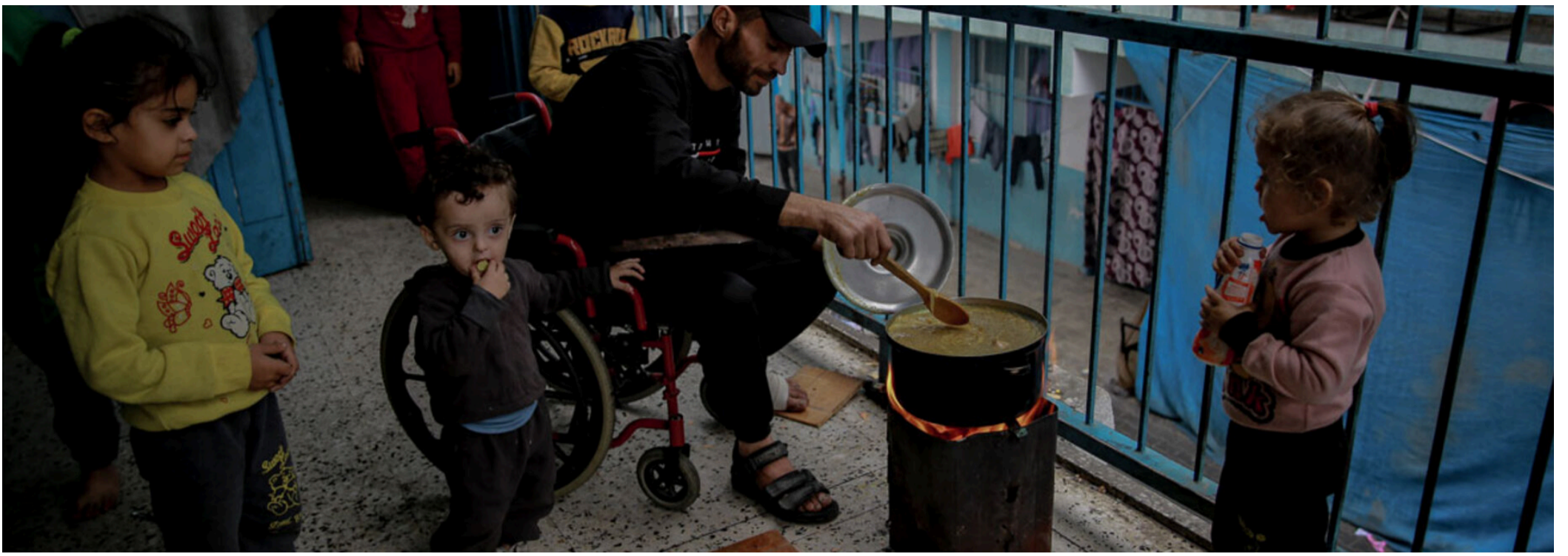
Gaza grapples with catastrophic hunger as new report predicts famine if conflict continues. A displaced Palestinian man cooking food on wood fire due to gas shortages in the schools where he takes shelter with his family. Photo by UNICEF/Omar Al-Qattaa, 7 December 2023