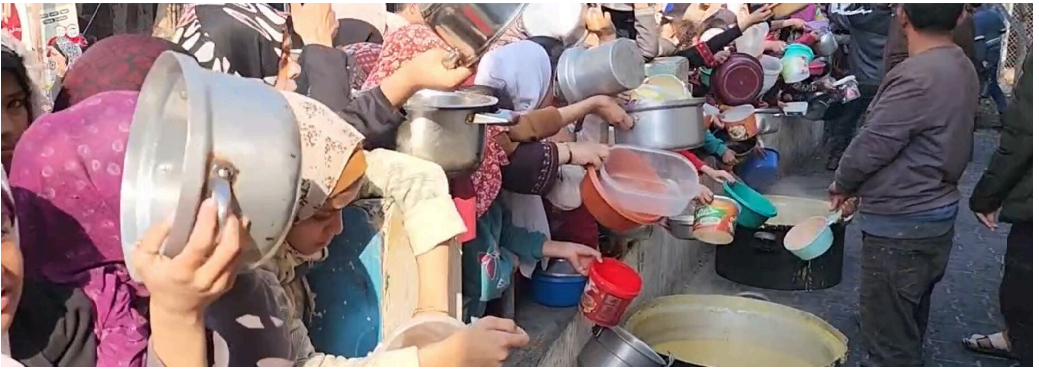
Women and girls in Rafah, southern Gaza Strip, holding pots and other empty containers in front of a group of volunteers preparing soup for displaced families. On 22 December, the Secretary-General warned that "widespread famine looms," following the Integrated Phase Classification (IPC) Special Briefs produced by the IPC global initiative on Gaza.