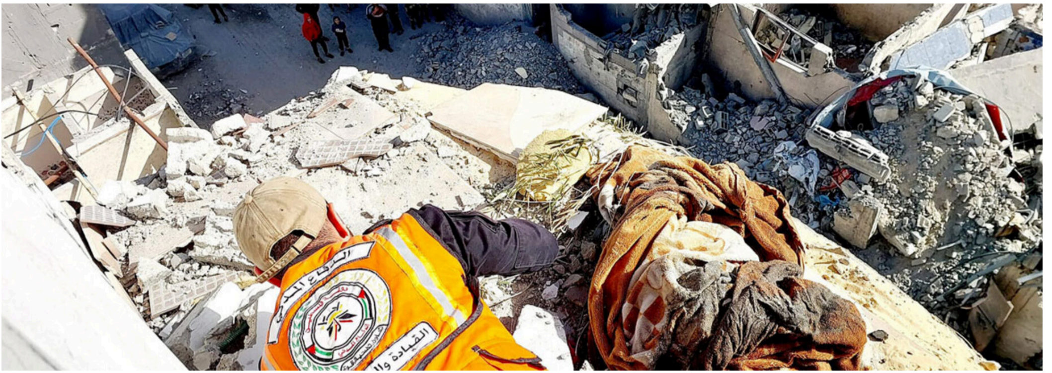
A Civil Defence team member works to safely dismantle a wall at risk of collapse in a high-rise building struck during hostilities in Rafah, Gaza's most densely populated area, where a large number of displaced people are seeking relative safety. Photo by the Civil Defence, 10 January 2024.