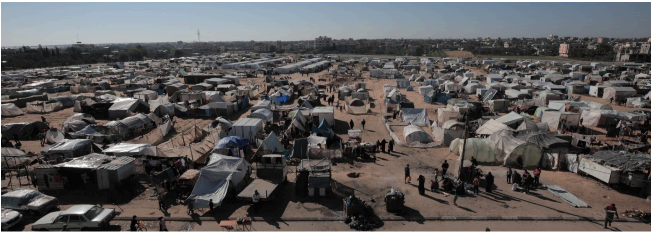
Makeshift shelters erected by displaced people in Al Foukhari area of southern Gaza. Tents and improvised structures have been set up wherever possible, including on sidewalks, in squares and even in the middle of streets. 10 January 2024