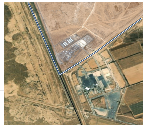
Kerem Shalom crossing, 3 May 2024

Number of drivers and trucks cleared by Israel to use fence road is insufficient to meet demand, causing delays and fewer aid deliveries than planned.