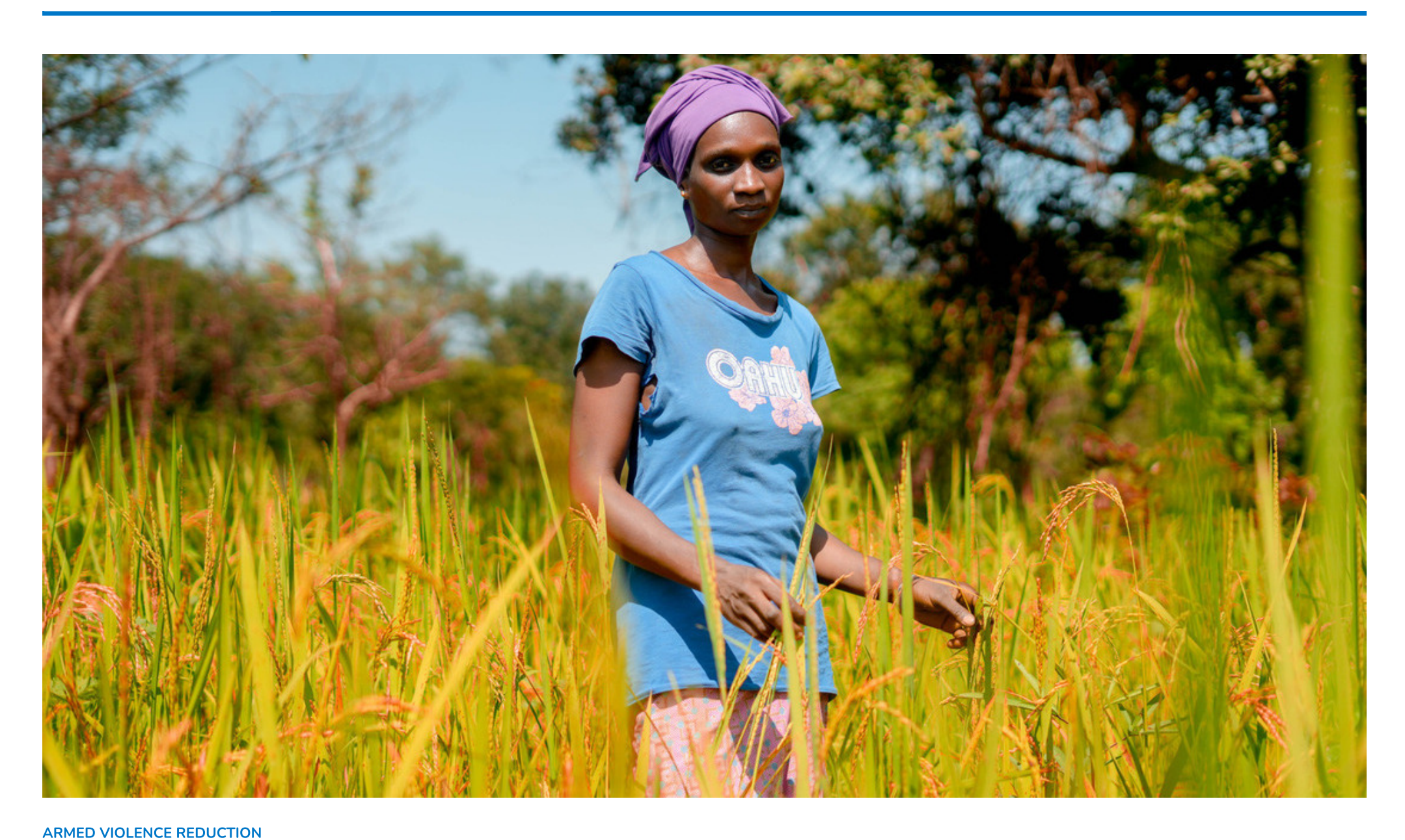
Bissine: Life after landmines