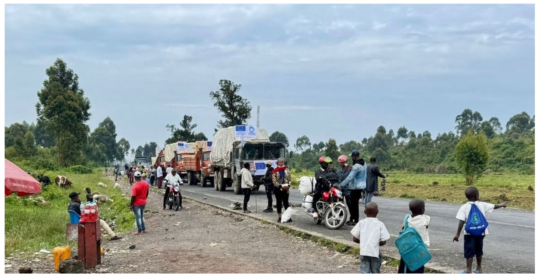
EMERGENCY | HEALTH | REHABILITATION 2.6 million people in urgent need of humanitarian aid in North Kivu