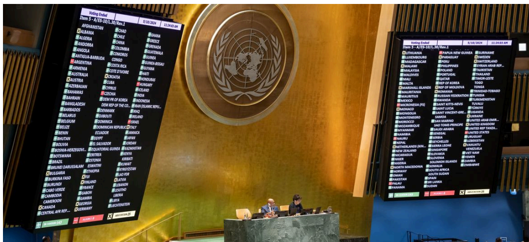
Results of the General Assembly’s vote on the resolution on the status of the Observer State of Palestine.

“This resolution does not resolve the concerns about the Palestinian membership application raised in April in the Security Council...and should the Security Council take up the Palestinian membership application as a result of this resolution, there will be a similar outcome,” he said.