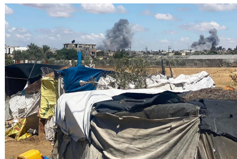
Smoke rises above Rafah as bombardments continue.

Read our explainer on Palestine's status at the UN here .