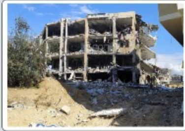
Al Karama Specialized Hospital

Map Production: oPt Health Cluster Team Map Date: 2024-02-20