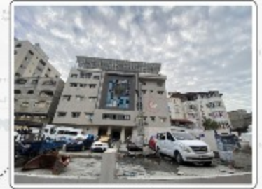
Al Awda Hospital (North)