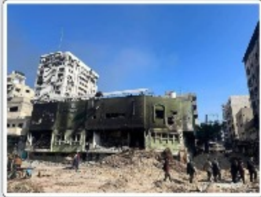
Patient Friends Association Hospital