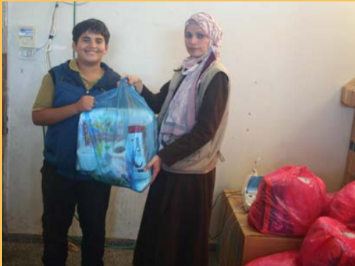
Family Hygiene Kits