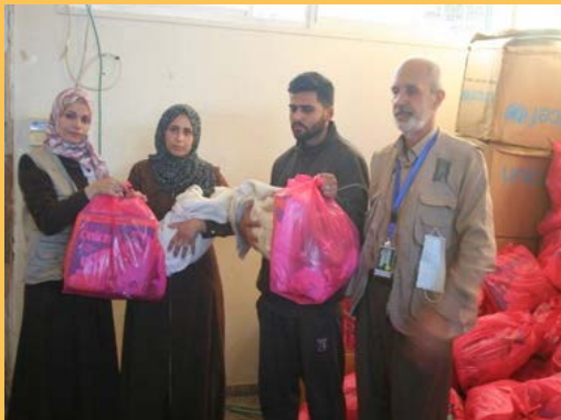
Neonatal Hygiene Kits