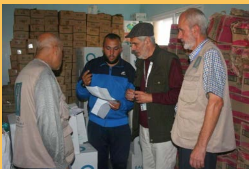
Medications & Medical Supplies

Juzoor continues to work with our global partners to supply shelters and the people of Gaza with the resources they need, focusing on medical needs and health necessities.